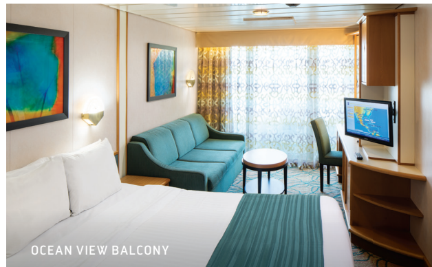
OCEAN VIEW BALCONY