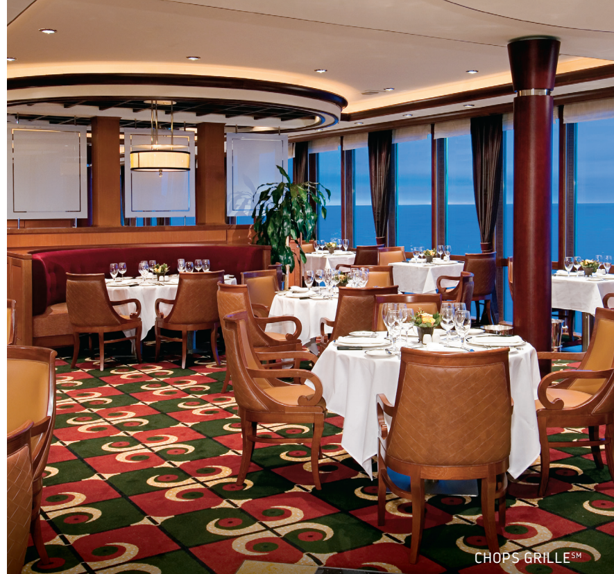
CHOPS GRILLE SM