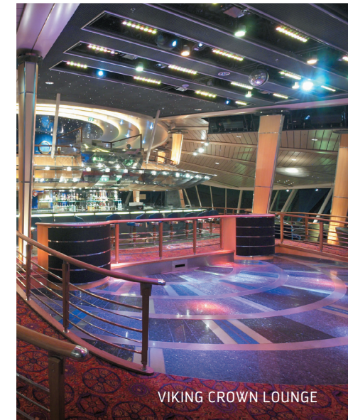
VIKING CROWN LOUNGE